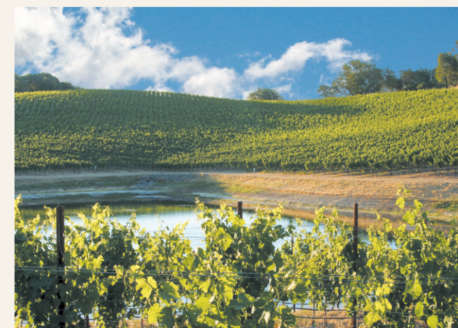
DCV9 - Estate Endeavour Vineyard, Lytton Springs

As the winery continued to grow, a need for more Cabernet Sauvignon grapes sent Don on a chase for a new vineyard site. For almost five years, he scoured the Dry Creek Valley for the ideal location. Using an airplane and topographic maps, Don zeroed in on the Lytton Springs area as a possible locale for a new vineyard. "I saw this area from the air and it just looked perfect. Then, when I actually walked the ground, I knew this was it. The combination of excellent soil conditions, drainage and sun exposure were ideal." There were other desirable characteristics as well. In looking to create a sustainable vineyard ecosystem, it was obvious that the amphitheater-style setting would allow for rain water sheet flow - essentially creating a natural pond and giving the vineyard its own water source.