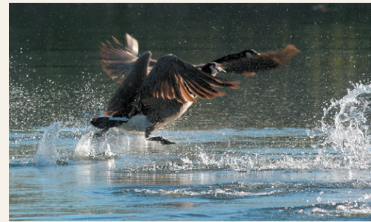
Wildlife at Endeavour Vineyard

on its own. Another exciting aspect is the closed loop system the vineyard employs. During the rainy months, water is collected in the pond, the water then irrigates the vines, and the vines transpire the water, releasing it to the atmosphere to be returned later as rainfall. At Endeavour Vineyard we do very little leafing or hedging and the need to drop fruit during the growing season is nominal. The vineyard is able to moderate even growth throughout the