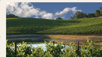
DCV9 - Endeavour Vineyard