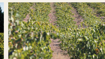
DCV2 - Four Clones Vineyard