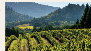
DCV7 - Wallace Ranch

Planted in 1882, Beeson Ranch is one of Dry Creek Valley's oldest and most prized vineyards. Located along West Dry Creek Road, Beeson Ranch faces east and extends up several gentle hillsides to a forest of conifer trees. The old gnarled vines, first planted by Italian immigrants, provide us with some of our most intriguing Zinfandel grapes. Our Beeson Ranch Zinfandel is the perfect